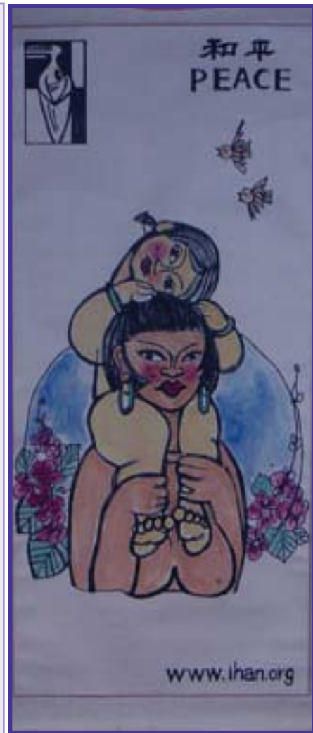
Poster created exclusively for IHAN by Ming Chen from Shanghai, China